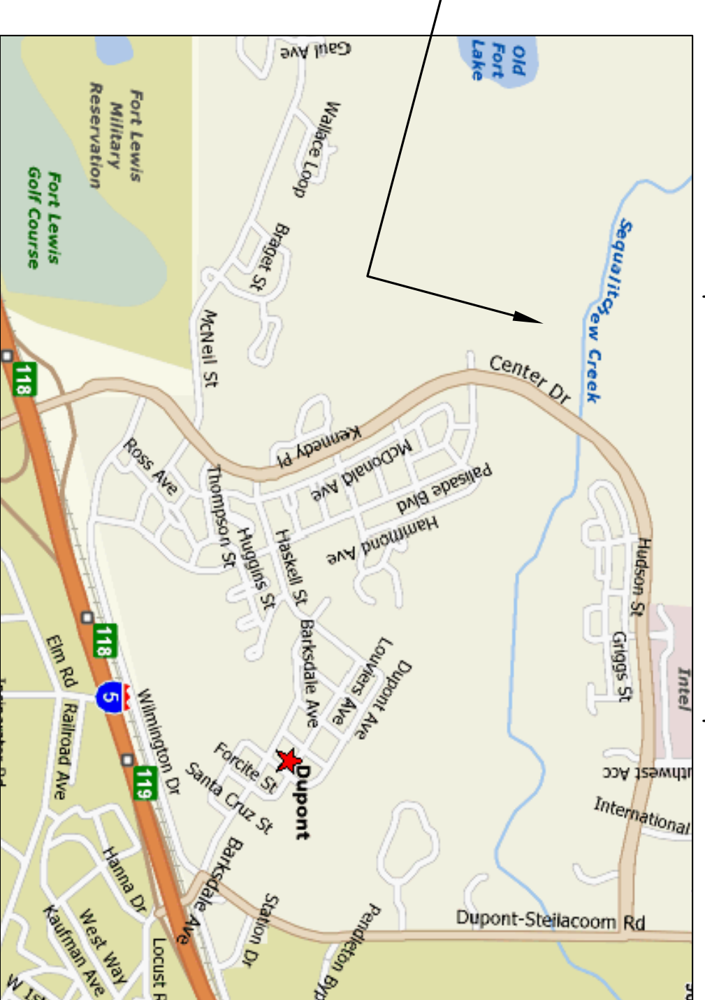
VICINITY MAP SCALE: N.D.S.