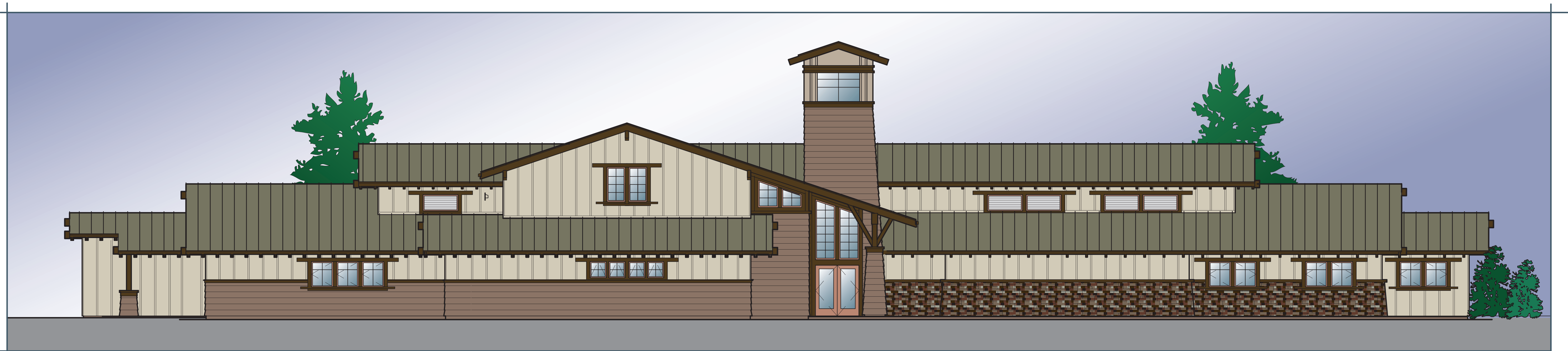
CITY HALL - WEST (FRONT)